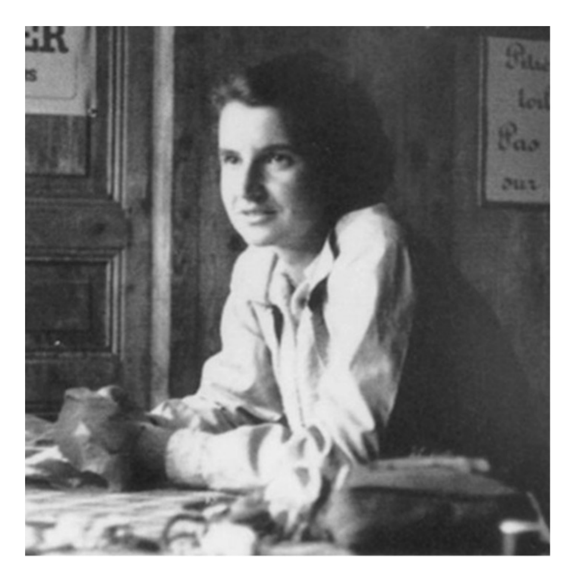
Rosalind Franklin in Paris

March is Women's History Month , a time to celebrate the achievements of women throughout history. Science trailblazer Rosalind Franklin's work on <u>elucidating the DNA double helix</u> paved the way for modern molecular biology, with applications to medical and forensic science.