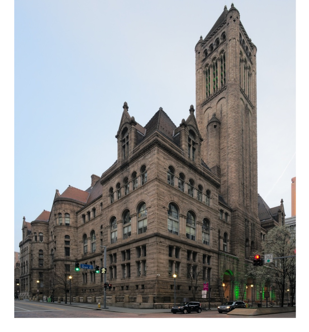
Allegheny County Courthouse

In January 2023, the body of Kenneth Lennex was found in a wooded Pittsburgh area, shot eight times in the head. Police discovered blood and bullets at a suspect's home on Kingsboro Street. A Taurus pistol and a revolver were tested for DNA. The crime lab reported, "Due to the data being uninterpretable, no comparison can be made to the reference samples."