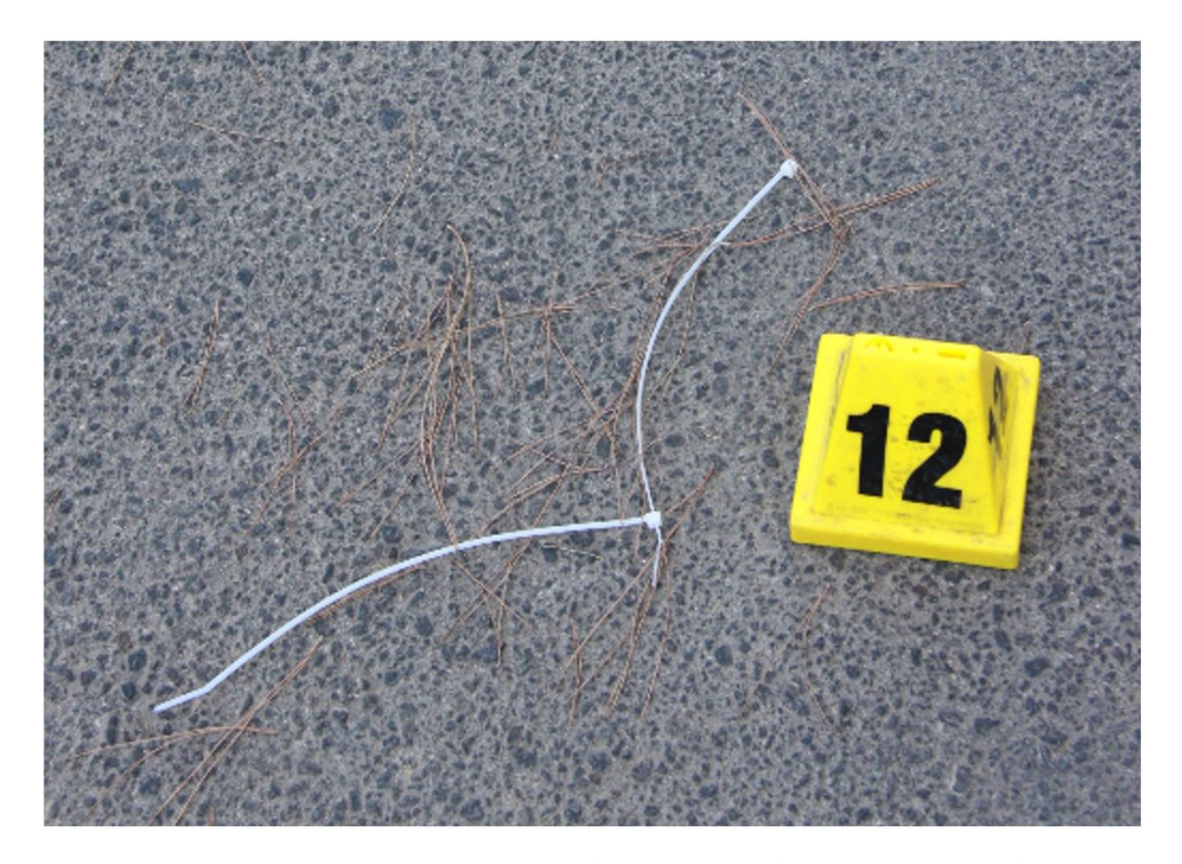
Zip tie dropped on Quantico road by rapist fleeing Bakersfield apartment after 911 call.